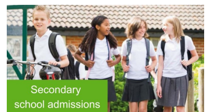
Secondary school admissions