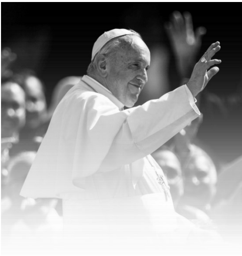
POPE FRANCIS REQUIESCAT IN PACE

We continue to be deeply saddened by the news of the passing of Pope Francis on Easter Monday, and continue to pray for the happy repose of his soul. As recognised in the statement made by the Bishop of Nottingham, "the Pope has left an indelible mark on the Church and the world, as a man of great warmth and humility who made use of his global prestige to highlight and to listen to the concerns of the poorest and most marginalised people across the world. The loss of the Holy Father will be deeply felt in all of our diocesan communities and well beyond, but I believe his legacy will live on." We thank Pope Francis for his valiant service and for highlight his concerns of the poorest and most marginalised people as well as his concerns for Earth, our common home.