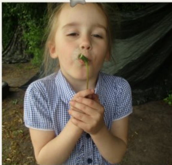
PLAY AND WORK WITH NATURE