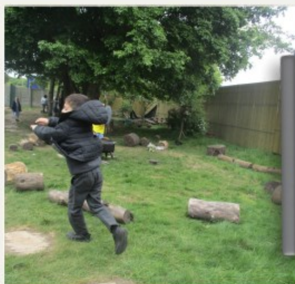
HAVING MANY LAUGHS.