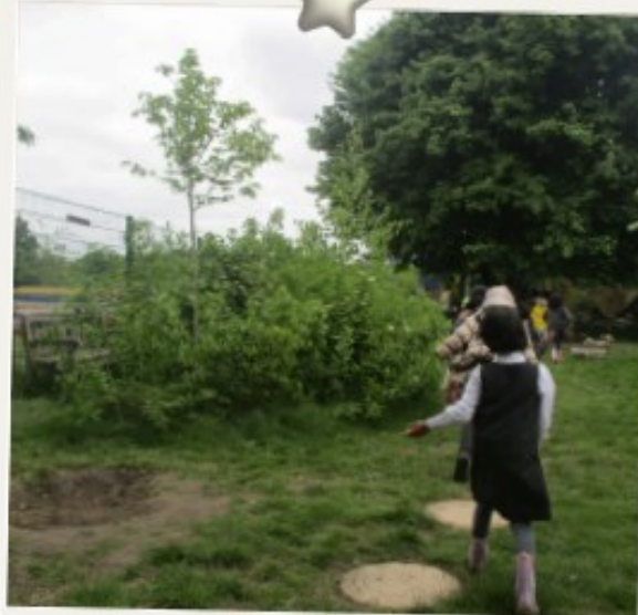
WE HOP ALONG THE PATHS