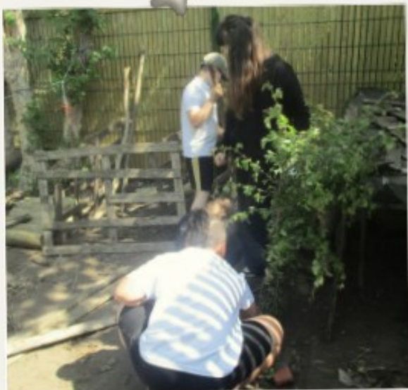
FORESTS SCHOOLS IS OPEN -